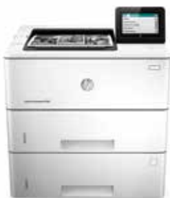
HP LaserJet Enterprise M506x