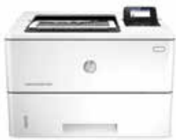
HP LaserJet Enterprise M506n

Finish key tasks faster with a printer that starts right away and helps conserve energy. 1 Multi-level device security helps protect from threats. 6 Original HP Toner cartridges with JetIntelligence and this printer produce more high-quality pages. 2