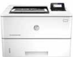
HP LaserJet Enterprise M506dn