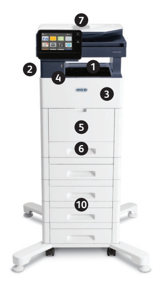
Xerox® VersaLink® C505 Color Multifunction Printer Print. Copy. Scan. Fax. Email.