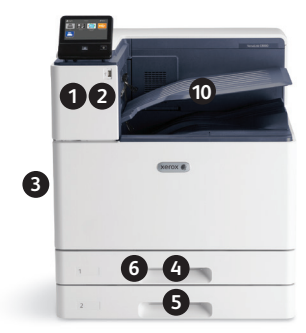
Xerox® VersaLink® C8000 and C9000 Default Configuration