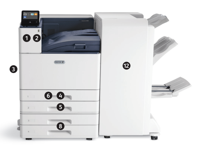
Xerox® VersaLink® C9000 Color Printer Print. Mobile connectivity.