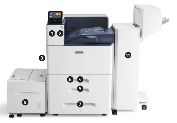
Xerox<sup>®</sup> VersaLink<sup>®</sup> C8000 Color Printer Print. Mobile connectivity.